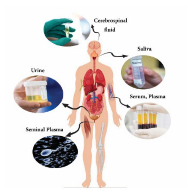
Figure 1. Schematic presentation of body fluids as the liquid biopsy sources

Although cfDNA has been introduced in 1948, utilizing it as a biomarker for cancer detection has drawn great amounts of attention in two recent decades. It can be released by the primary tumor or metastatic sites and more importantly, relatively low levels of cfDNA can be detected in individuals without any diseases (8). Circulating tumor DNA is a potential biomarker with a high capability to be detected easily, nonetheless, it has a severe limitation that restricted the wide usage that. It has